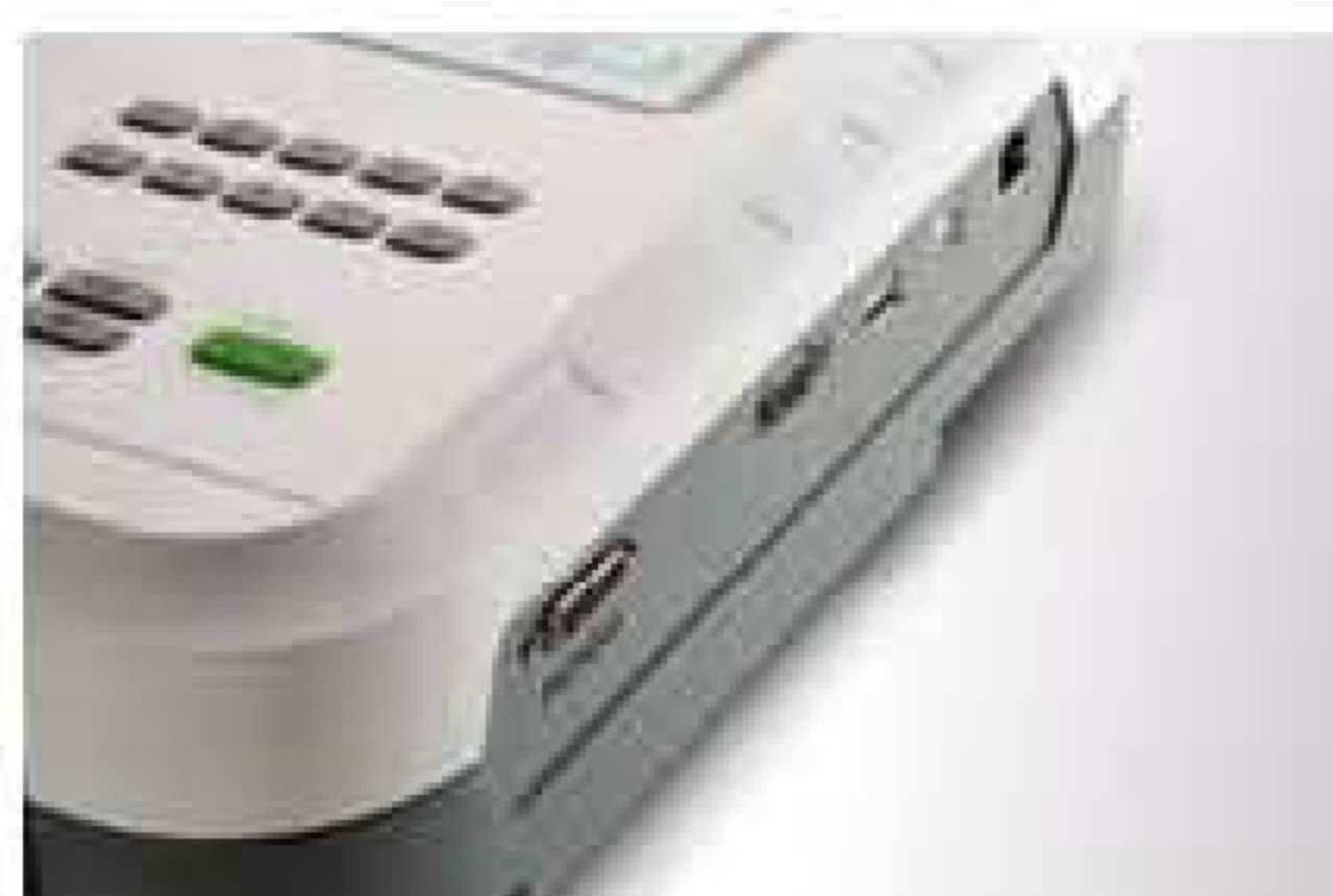
Memory of 300 ECG records; USB for data transmission; PC-ECG management system